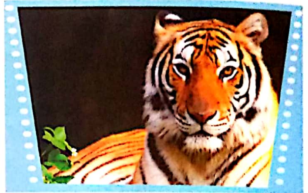
National Animal of India—Tiger