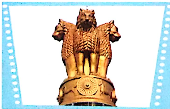
National Emblem of India—Lion Capital