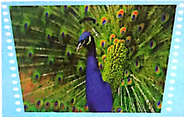
National Bird of India—Peacock