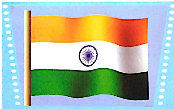
National Flag of India—Tiranga