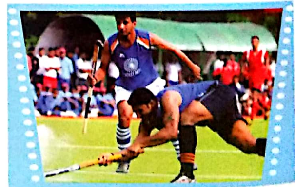
National Game of India—Hockey