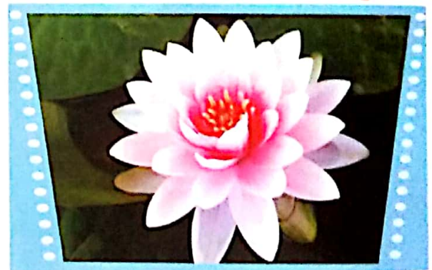
National Flower of India—Lotus